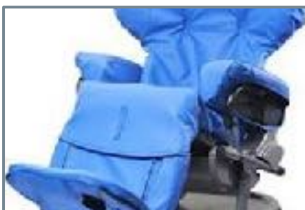
Seating to help you relax