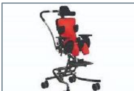
Specialist seating for activities